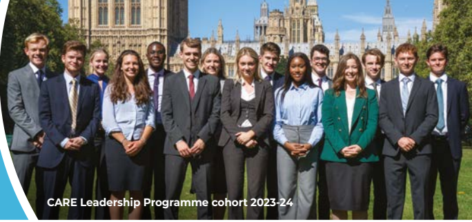
CARE Leadership Programme cohort 2023-24